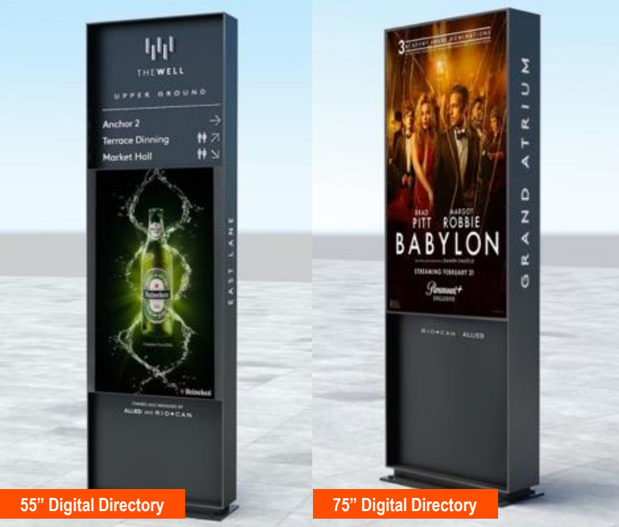
55" Digital Directory